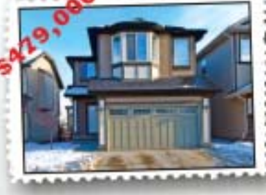
262 Auburn Bay Blvd. SE

Magnificently upgraded home in the lake community of Auburn Bay. This home presents like a showhome. Victoria stained maple adorns the main floor, accented by 9' ceilings, stunning kitchen with island, high end SS appliances and a walk through pantry.