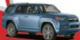
ALL-NEW 2010 4RUNNER 4X4 From $528/mth