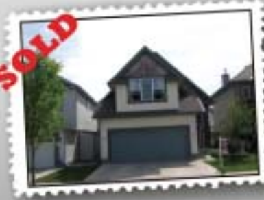
340 Copperfield Blvd. SE

Great open plan, perfect for entertaining. From the open kitchen, nook and great room with fireplace, to the HUGE fully developed basement. Basement comes with 2 bedrooms and large rec room you will not find in a 2 storey. There is also a cozy bonus room to enjoy as well as a large deck.