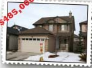
10 Everwillow Close SW

Just like new - Jaymen Masterbuilt 2 storey home located in the heart of Evergreen. All stucco exterior with an extra layer of insulation. Inside you'll find carpet and ceramic tile on the main floor with a very open concept design.