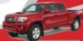
ALL-NEW 2010 TACOMA 4X4 1.9% Financing Avail.